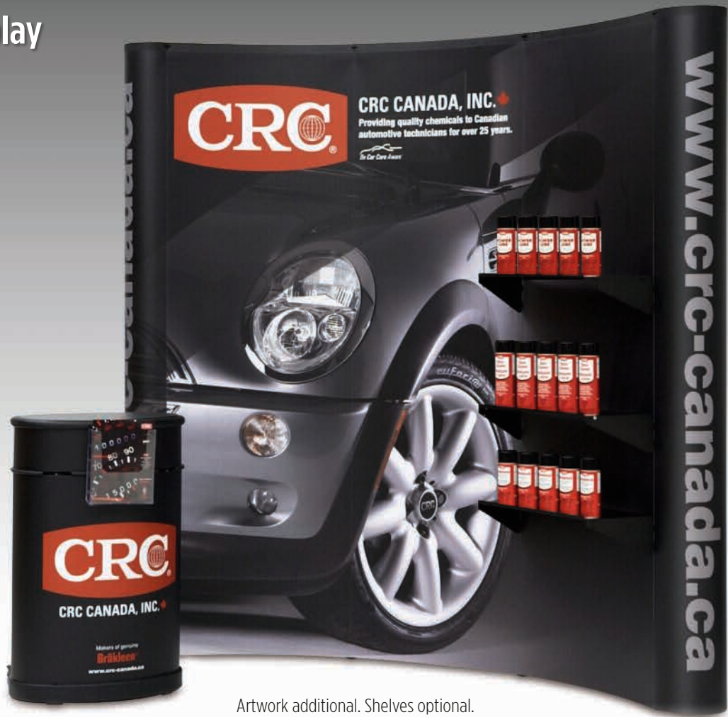
Artwork additional. Shelves optional.